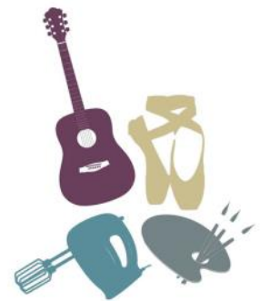
Paul Nigra Center for Creative Arts

Links for registration for any of these classes is available in each description. For more information, call (518) 661-9932 or visit the website at www.pncreativeartscenter.org