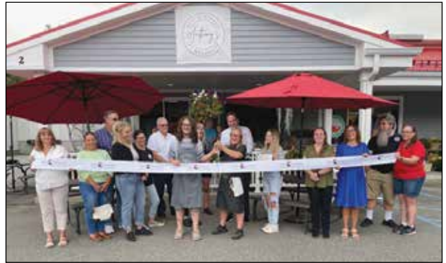
The ribbon-cutting for Anthony’s Deli & Market at 1451 State Highway 5S in the town of Amsterdam.