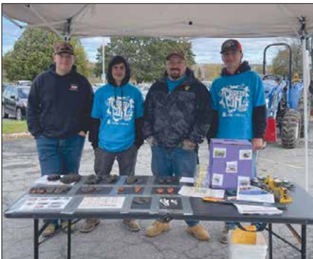
CTE faculty and students at CareerCon.