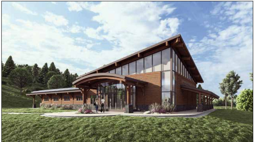
THIS PAGE AND NEXT: artist renderings of the Great Sacandaga Lake Discovery Center (GSLDC).

Created in 1930, the Great Sacandaga Lake is a manmade body of water built to mitigate flooding that