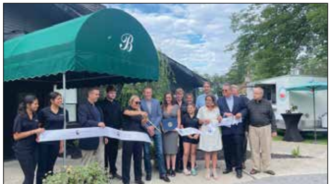
The ribbon-cutting event at the renovated The Bridge Walk in Perth.