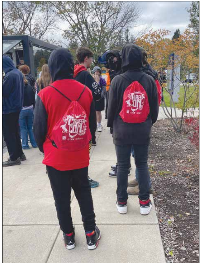
Eighth graders don their “Career Con” bags.

CAREER CON was an idea that came from district superintendents and teachers who wanted to give their eighth graders career awareness through “hands on” exposure to our regional businesses, and the opportunity to speak with business representatives about what type of jobs are available at their businesses and in our region. In addition, businesses were telling the Chamber that they also wanted the opportunity to expose students to what they have to offer earlier.