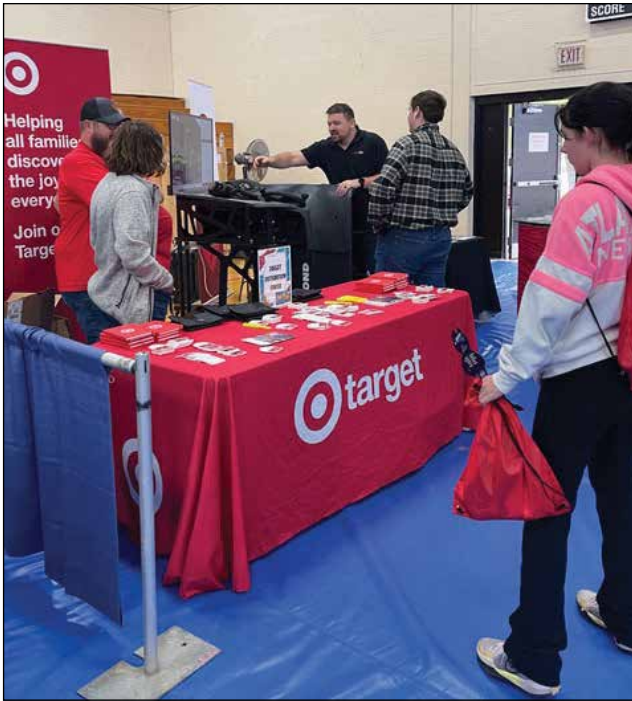
Employees of Target Distribution Center speak with students.